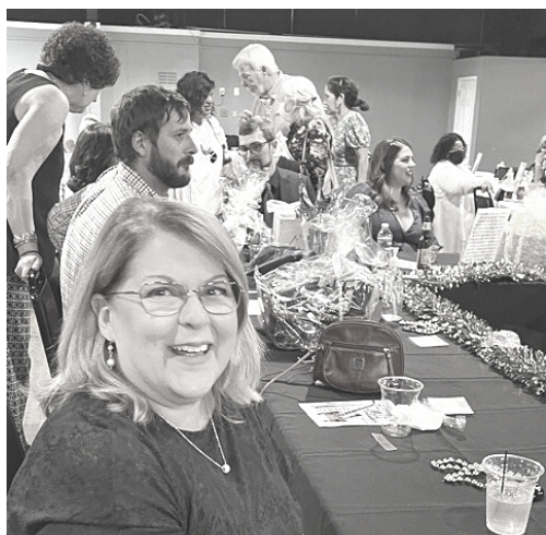
Guests of premiere sponsor, Gardberg & Kemmerly Attorneys at Law, said this was Ozanam's best event ever!