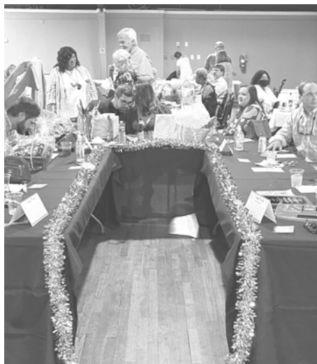
Premiere sponsor, Gardberg & Kemmerly and guests.