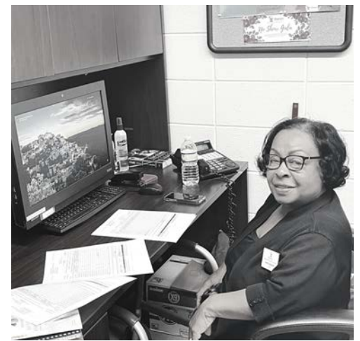
Retired seniors who serve as volunteers in various capacities also enhance our patient service experience.