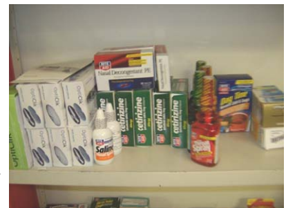
Over-the-counter medication purchased with Rite Aid 's Gift Cards.